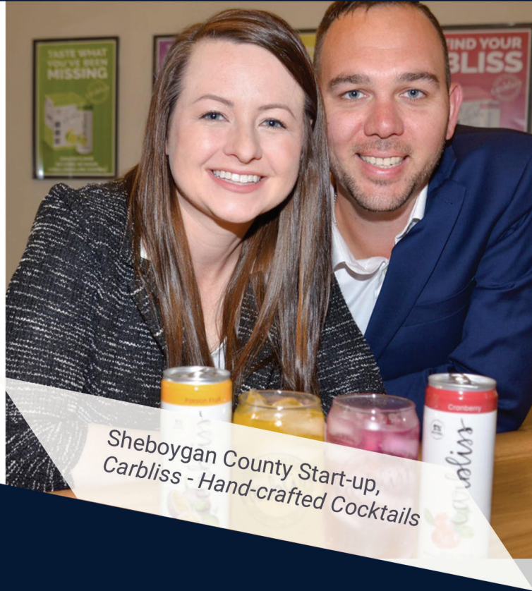
Sheboygan County Start-up, Carbliss - Hand-crafted Cocktails