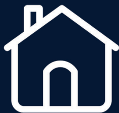
Single Family Home Development