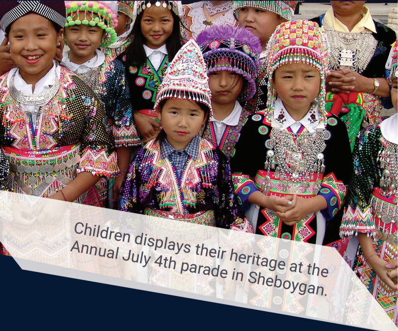
Children displays their heritage at the Annual July 4th parade in Sheboygan.