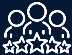
Talent Development, Recruitment, and Retention