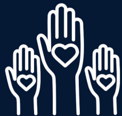
Enhance Diverity, Equity, Inclusion, Belonging Programs