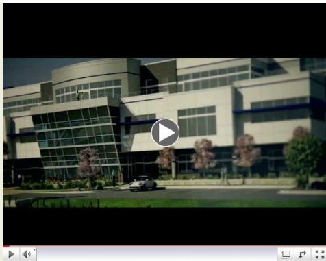
Keeping the Promise of Sheboygan County