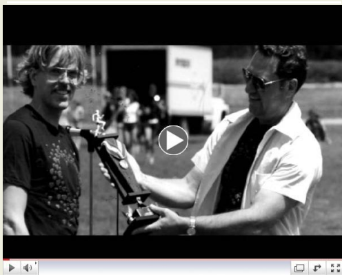
American Orthodontics Wins 2012 "Economic Driver of the Year"