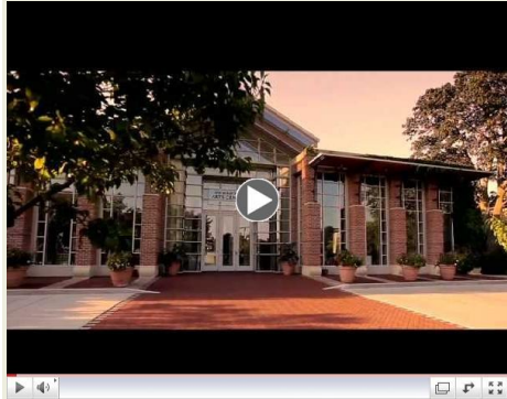
The Promise of Sheboygan County