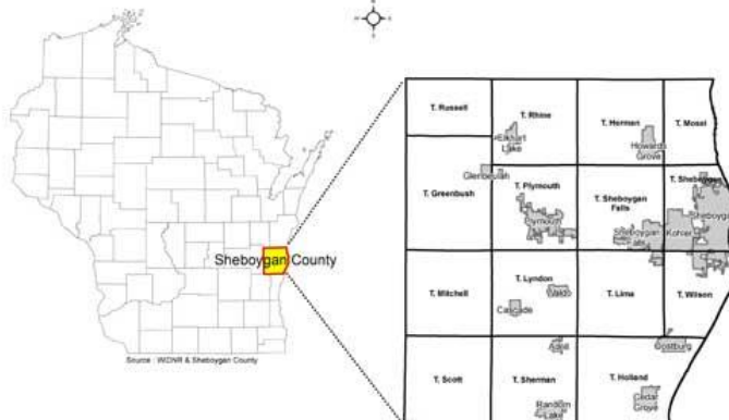
Sheboygan County, WI